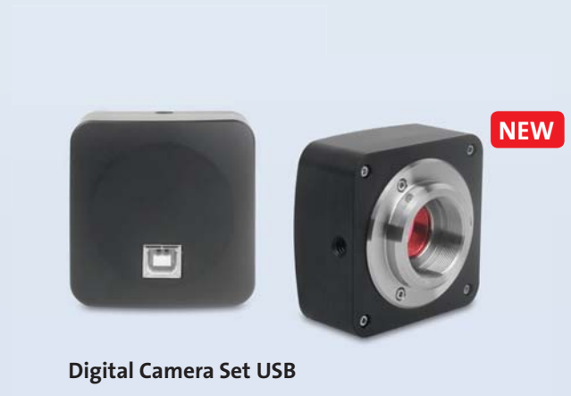
Digital Camera Set USB