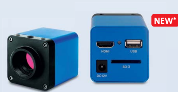
Digital Camera Set HDMI