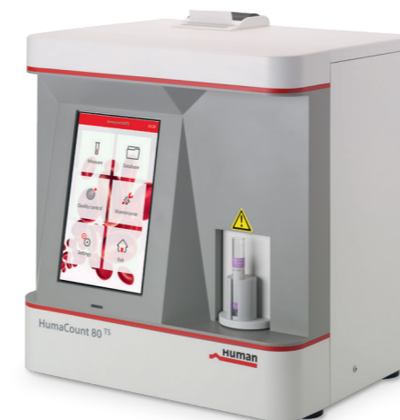
HumaCount 30 TS 1 measuring chamber = 30 samples/hour